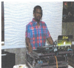
Music By: DJ FACE